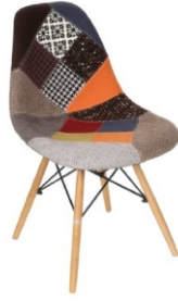
DSW Patchwork New