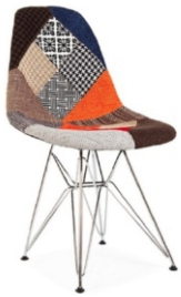
DSR Patchwork New