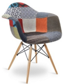
DAW Patchwork New